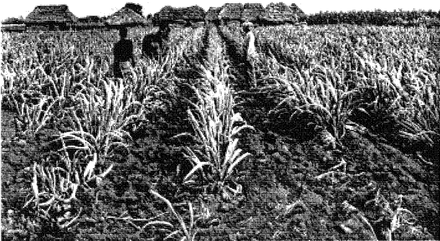
A typical sugar cane farm of the 1930s and 40s, with thatched houses in the background. Bullocks replaced horses later, followed by tractors.

faded as the girmitiyas struggled with the pressing problems of day-to-day existence in a new life, to which ancestral wisdom was proving frustratingly irrelevant. Well-trying methods of cultivation were woefully inadequate, tools and implements different, and the soil hard and untamed. Things which had been taken for granted in India—what to plant, when and how— all now posed perplexing problems. There was no biradari (brotherhood) and no village panchayat (village council) to lean on for advice and assistance. But most struggled on and many achieved at least a modicum of prosperity. The Leonidas migrants would have reason to be satisfied with the legacy they bequeathed to their descendants, the new girmitiyas .